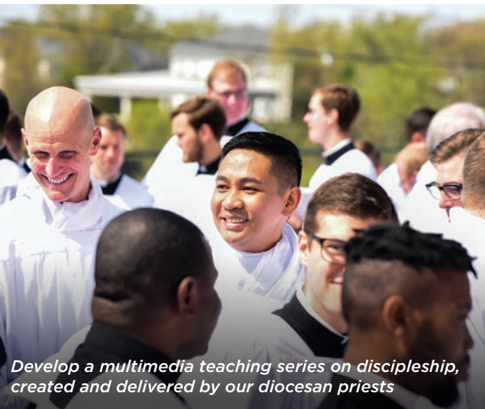
Develop a multimedia teaching series on discipleship, created and delivered by our diocesan priests