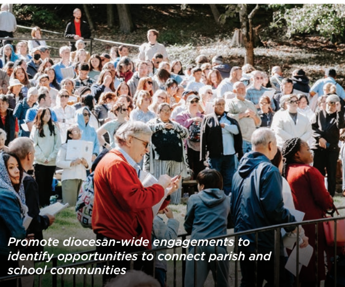
Promote diocesan-wide engagements to identify opportunities to connect parish and school communities

In communion with the universal Church, we strive to be disciples of Jesus Christ by proclaiming the Kingdom of God in both Word and Sacrament throughout our diocese, and by working together in the service of charity and mercy so that all may know the joy of the Gospel.