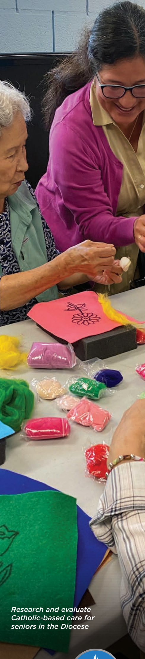
Research and evaluate Catholic-based care for seniors in the Diocese