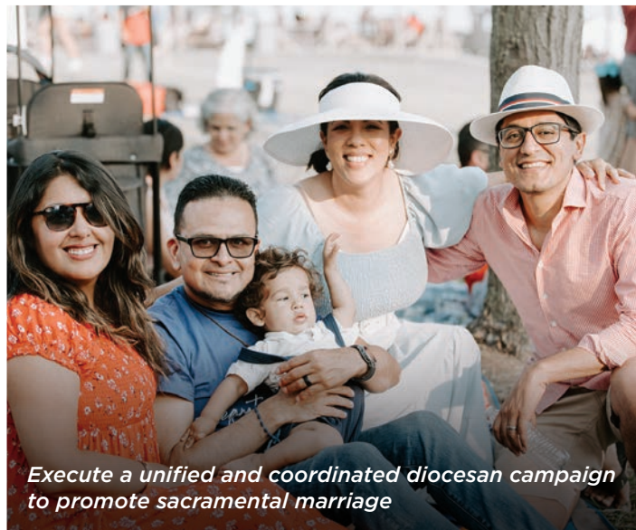
Execute a unified and coordinated diocesan campaign to promote sacramental marriage

To find out more about the diocese's Strategic Plan, scan the QR code or visit our website: www.arlingtondiocese.org/strategic-plan