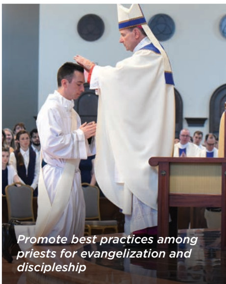
Promote best practices among priests for evangelization and discipleship