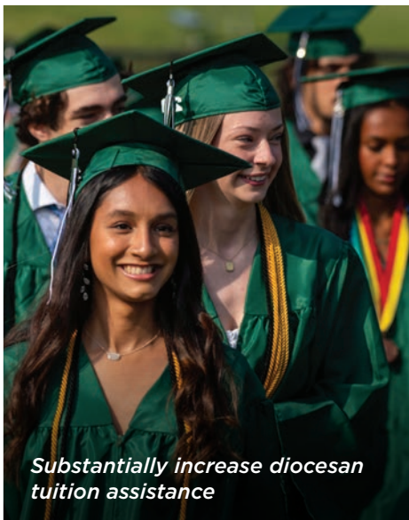
Substantially increase diocesan tuition assistance